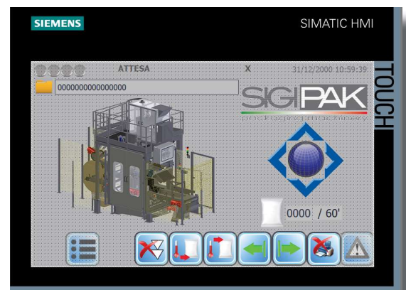
9" COLOR TOUCH SCREEN